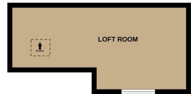
1ST FLOOR 192 sq.ft. (17.8 sq.m.) approx.